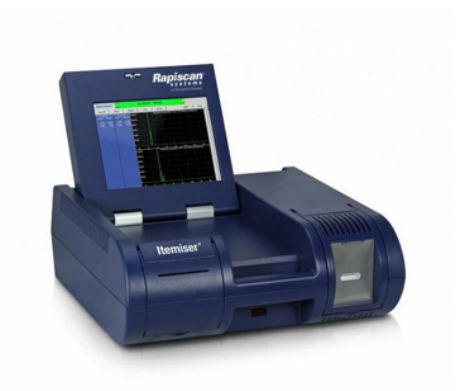
Figure 8: Rapiscan Systems' Itemiser 4DN is an IMS device that can detect narcotics in 8 seconds.

One of the most prevalent chemical detection technologies employed in correctional facilities is IMS because of its ease of use and high sensitivity.<sup>39</sup> IMS can detect and identify a large range of drug compounds, including synthetic cannabinoids, synthetic cathinones, fentanyl, carfentanil, cocaine, and methamphetamines; however, the systems are not reliable in detecting THC in the form of cannabis. 40, 41, 42 Currently, the Pennsylvania Department of Corrections uses the Rapiscan Itemiser 3E IMS device (a new version of the device can be seen in Figure 8) in each of the state's 25 prison facilities in response to a series of drug overdoses related to synthetic cannabinoids. This system can detect more than 30 types of cannabinoids and is used to screen all incoming inmates, visitors, and prison staff.<sup>43</sup> Although successfully employed by many correctional facilities across the United States, IMS technology use in jails has been contested by visitors and staff who claim that IMS systems routinely generate false positives because they are hypersensitive. In response to these accusations and the numerous lawsuits filed against correctional facilities, the state of California decided to discontinue the use of IMS devices after an initial 3-year pilot.44