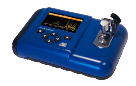
Figure 10: Smiths Detection's TargetID leverages Fourier Transform Infrared spectroscopy technology to identify up to 2,500 substances using a preloaded library.

thousands of drug compounds, including synthetic cannabinoids, synthetic cathinones, fentanyl, cocaine, methamphetamines, and their cutting agents. However, samples such as dried cannabis or synthetic cannabinoids sprayed on to plant material are not easily characterized by the technology.<sup>47</sup> Much like Raman spectroscopy devices, IR spectroscopy has not been widely adopted by U.S. correctional facilities for drug interdiction efforts. However, the capability to accurately identify a vast number of drug compounds is promising to mitigate the ever-evolving synthetic drug market. The Smiths Detection Target-ID system (seen in Figure 10 ) is one of the first IR spectroscopy devices developed specifically for drug identification in the field. The system uses a library of 2,500 drugs, cutting compounds, and precursors, providing a clear readout of the substance detected in less than 1 minute.<sup>48</sup> In addition to illicit stimulants and opioid drugs, the device is also capable of detecting synthetic cannabinoids and synthetic cathinones sprayed onto paper.